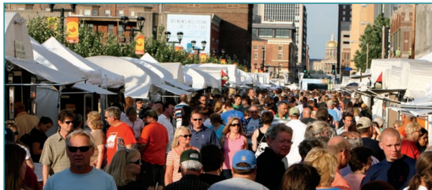
The Des Moines Arts Festival attracted more than 250,000 attendees in 2009.